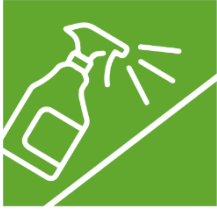
Venue is clean and kept clean

To minimise the spread of COVID-19, all venues need to be kept hygienically clean. All commonly used touch points and surfaces need to be cleaned frequently. This includes any equipment, stationery or resources passed between individuals. Venues should be thoroughly cleaned between sessions.