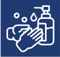
Hygiene is robust – handwashing etc

To minimise the spread of COVID-19, all venues need to be kept hygienically clean. All commonly used touch points and surfaces need to be cleaned frequently. This includes any equipment, stationery or resources passed between individuals. Venues should be thoroughly cleaned between sessions.